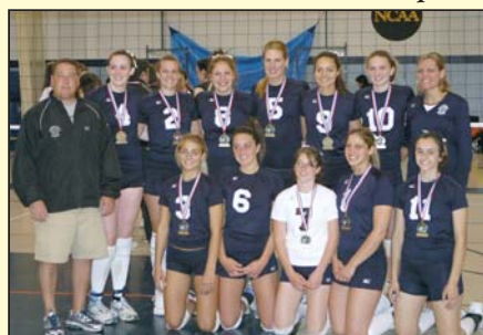
2007 - 18 & Under New England Champions