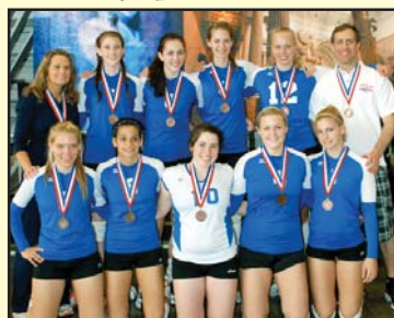
2008 - 16 & Under New England Region Representative at USA National Championships