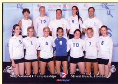
2009 - 17 & Under National Team at the Junior Olympics in Miami Beach, FL